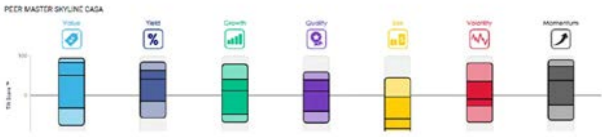
Figure 2: Style Analytics Master Skyline, Custom Peer Group Above Median Emerging Markets Equity.)

Comparing the factors that drove the markets to the factors that drop active manager performance, Momentum stands out, especially within the quantitative and small cap focused products. Other: Ex China, Frontier & Low Volatility.