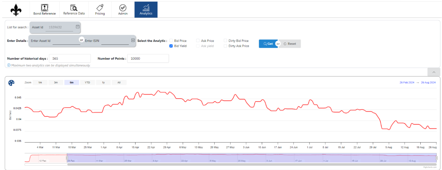
Figure 1 10-Year US Treasury Rates