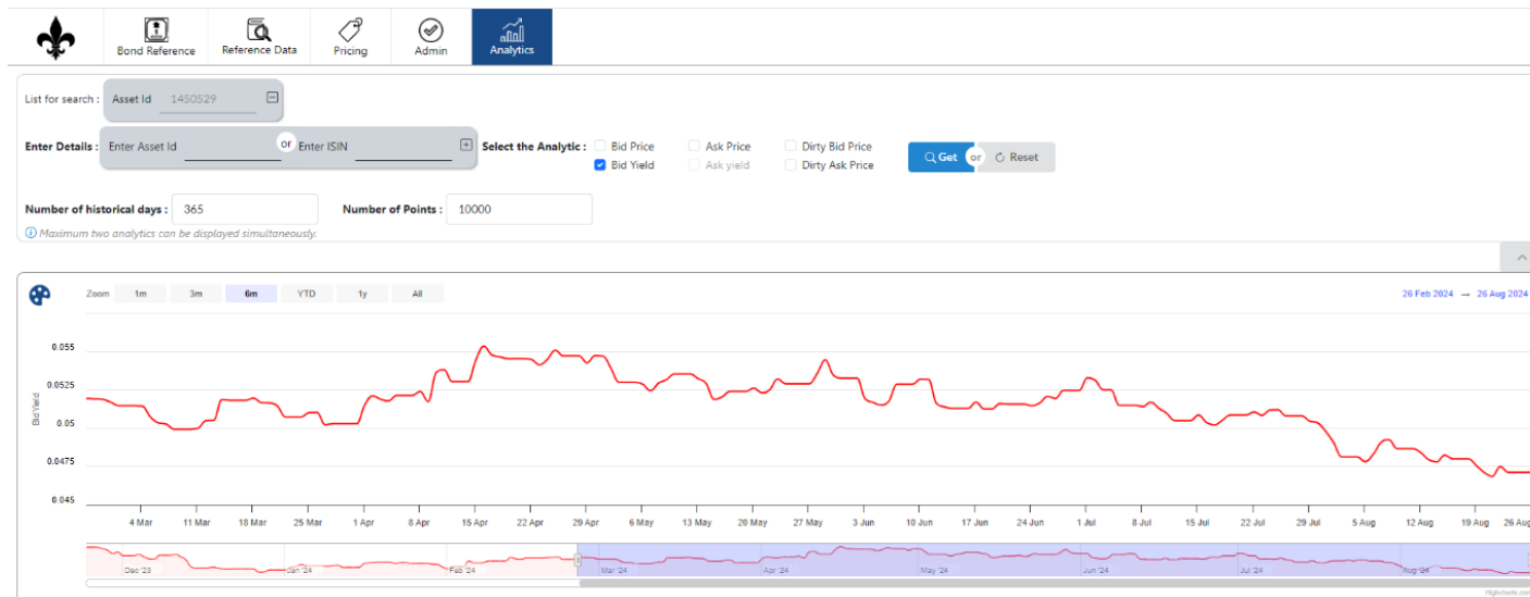
Figure 2: US Corporate bond, BBB+, Norfolk Southern Corp., 2024, 5.5% USD